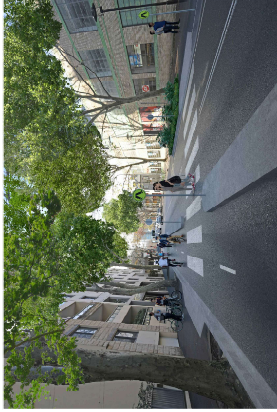
Artist impression - Miller Street